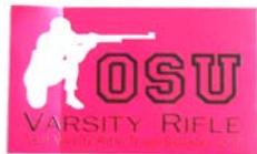
OSU Varsity Rifle Sticker $2