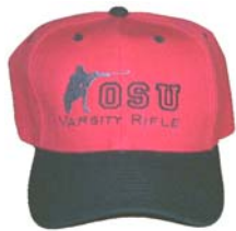
OSU Varsity Rifle Hat $10